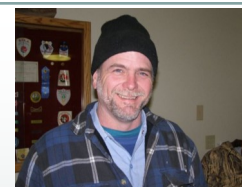
Nor Cal / Legislative