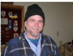
Nor Cal / Legislative

Region archery club tournaments start February 17 th at Yuba Sutter Bowhunters 3D. Next will be Eldorado Hills Bowmen 3D March 3 rd and Nor Cal indoor March 10 th at Wilderness Archery and Yolo Bowmen tentative March 17 th . The next California Fish and Game Commission meeting (CFG) will be held February 6 th in Sacramento. 2019/20 mammal regulation changes will be presented to FGC from DFW. Bowhunting changes listed on agenda included going from casting a hunting arrow 130 yards minimum to a draw weight minimum for big game and removing regulation to allow carrying a firearm during an archery only season or archery only tag. Adopting these changes wouldn't take place until FGC meeting in April.