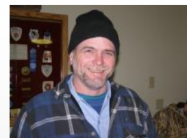
Nor Cal / Legislative

What is Nor Cal? The full name for this regional group is Nor Cal Bowhunters. They represent the areas 9 archery/bowhunting clubs and 3 archery pro shops to California Bowmen Hunters State Archery Association (CBHSAA). CBHSAA and Nor Cal are chartered to the National Field Archery Association (NFAA). What do Nor Cal and CBHSAA do for Archery or Bowhunting? There are many facets to their representation of Archery and Bowhunting. CBHSAA is "Dedicated to Promoting and Protecting the Archery and Bowhunting Heritages". This statewide organization speaks for California Archers and Bowhunters in matters concerning Legislation and Regulation since 1943. The Legislative committee of CBHSAA includes a Coordinator, 6 state area reps and each region group has one legislative representative. Archery is a shooting sport so at times issues arise to limit or exclude the shooting of Bows and Arrows for any purpose. CBHSAA will pursue those actions for the benefit of all Archers and Bowhunters.