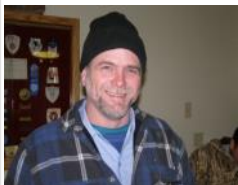
Nor Cal / Legislative

What is Nor Cal? The full name for this regional group is Nor Cal Bowhunters. They represent the areas 9 archery/bowhunting clubs and 3 archery pro shops to California Bowmen Hunters State Archery Association (CBHSAA). CBHSAA and Nor Cal are chartered to the National Field Archery Association (NFAA). What do Nor Cal and CBHSAA do for Archery or Bowhunting? There are many facets to their representation of Archery and Bowhunting. CBHSAA is "Dedicated to Promoting and Protecting the Archery and Bowhunting Heritages". This statewide organization speaks for California Archers and Bowhunters in matters concerning Legislation and Regulation since 1943. The Legislative committee of CBHSAA includes a Coordinator, 6 state area reps and each region group has one legislative representative. Archery is a shooting sport so at times issues arise to limit or exclude the shooting of Bows and Arrows for any purpose. CBHSAA will pursue those actions for the benefit of all Archers and Bowhunters.