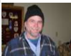
Nor Cal / Legislative