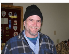
Nor Cal / Legislative

What is Nor Cal? The full name for this regional group is Nor Cal Bowhunters. They represent the areas 9 archery/bowhunting clubs and 3 archery pro shops to California Bowmen Hunters State Archery Association (CBHSAA). CBHSAA and Nor Cal are chartered to the National Field Archery Association (NFAA). What do Nor Cal and CBHSAA do for Archery or Bowhunting?