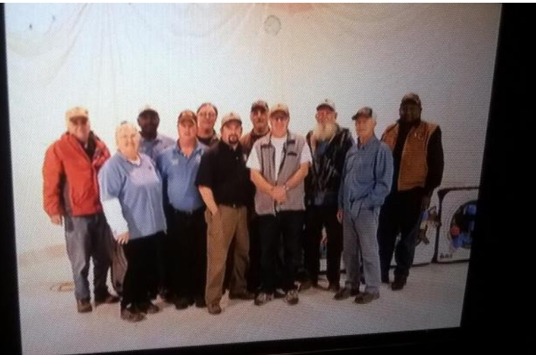
The whole gang !!!